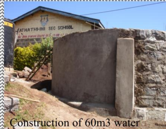
Construction of 60m3 water