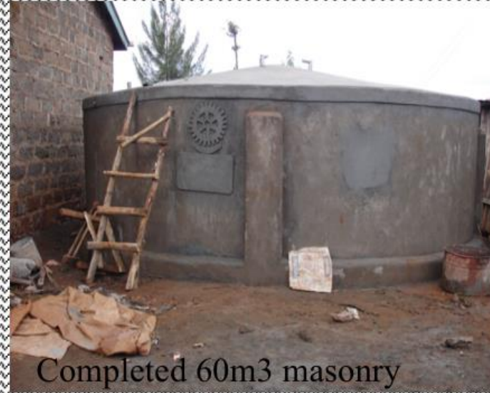
Completed 60m3 masonry water